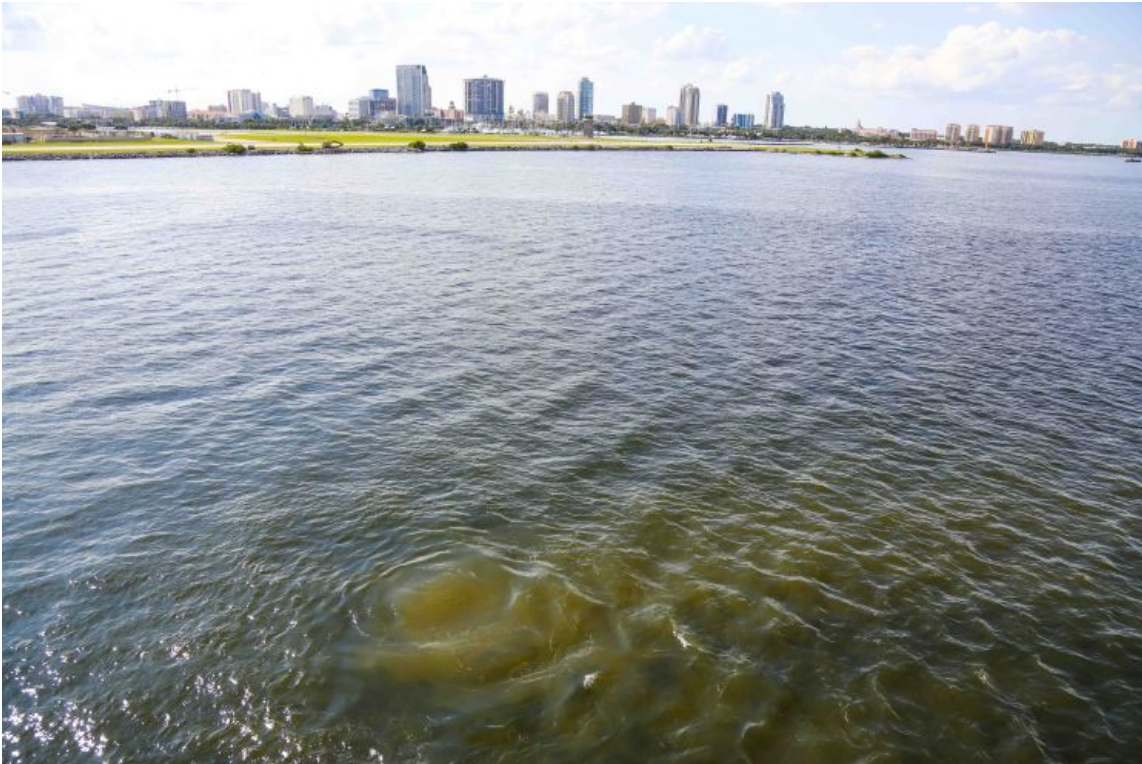
The Pinellas County Commission will discuss forming a task force to deal with the county's ongoing sewer woes.

• Jobsite Theater has opened its season with The Underpants, a Steve Martin adaptation of the 1910 play Die Hose. Read our review of the show , running now through Oct. 2 at the Straz Center for the Performing Arts Shimberg Playhouse in Tampa.